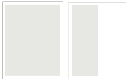
Full page 275 (height) x 210mm