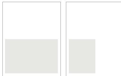
Horizontal 1/2-page 123 (height) x 196mm