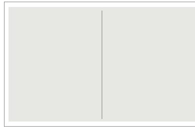
Double-page spread 275 (height) x 420mm

The Advertiser acknowledges that NZSTI relies on the provisions of this Clause in accepting the advertisement for production. The Advertiser hereby agrees to indemnify the Publisher against all losses or costs, legal or otherwise, arising as a result of the publication of the advertisement.