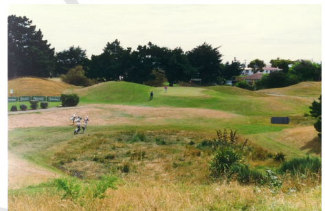
Celebrating the uniqueness of golf courses