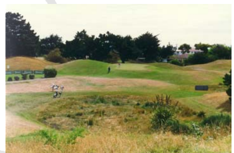
Celebrating the uniqueness of golf courses