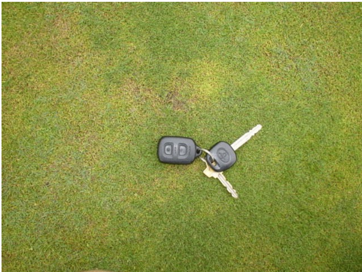
Anthracnose damaging a Poa annua dominant surface.